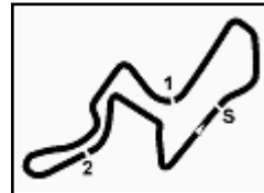
Kyalami 4.246 m