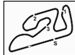
Ricardo Tormo 4.005 m